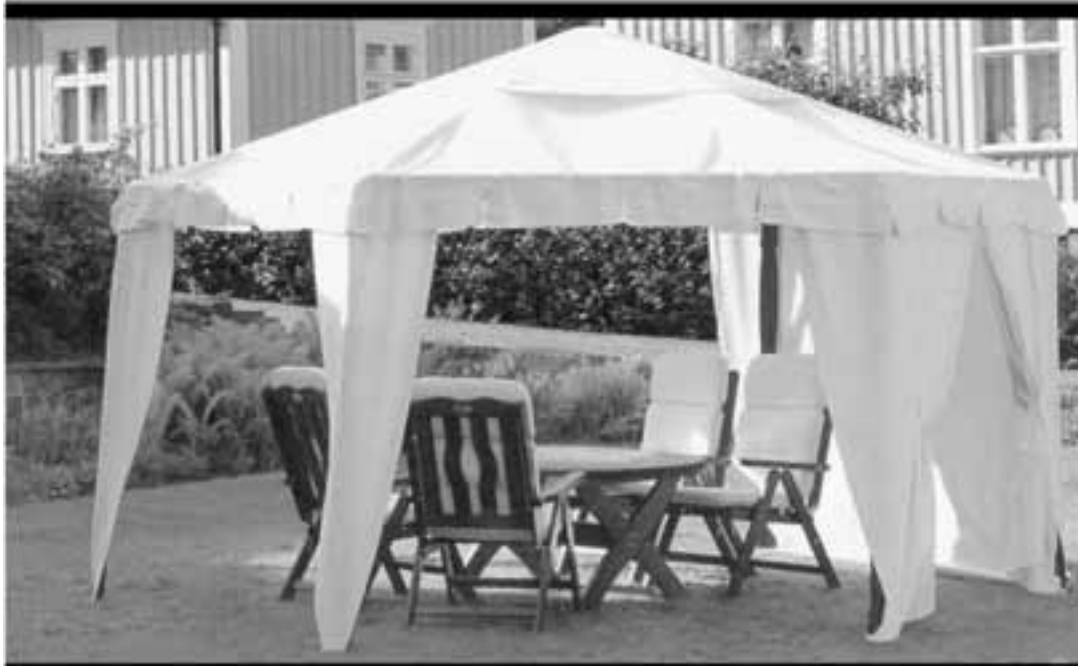
Gazebo Amelia. 400x271 h cm. € 590,00