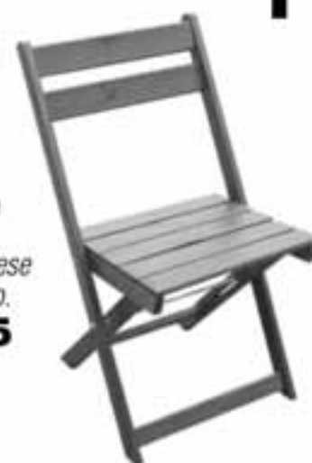
Sedia pieghevole Kalmar. In pino svedese tinto mogano. € 29,95