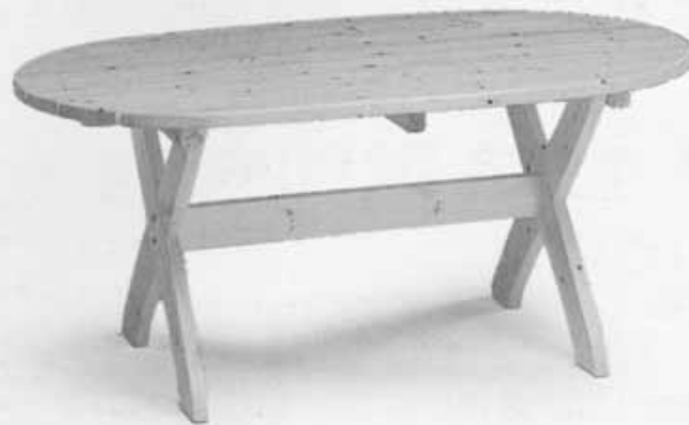
Tavolo ovale. In pino svedese tinto mogano; 86x150 cm. € 119,90