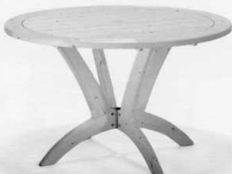
Tavolo tondo. In pino svedese tinto mogano; diam. 120 cm. € 219,00